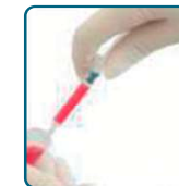
Pull plunger until stop ring