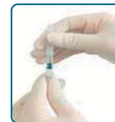
Remove protect cap