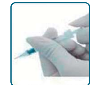
Complete self-destruct after drugs injection